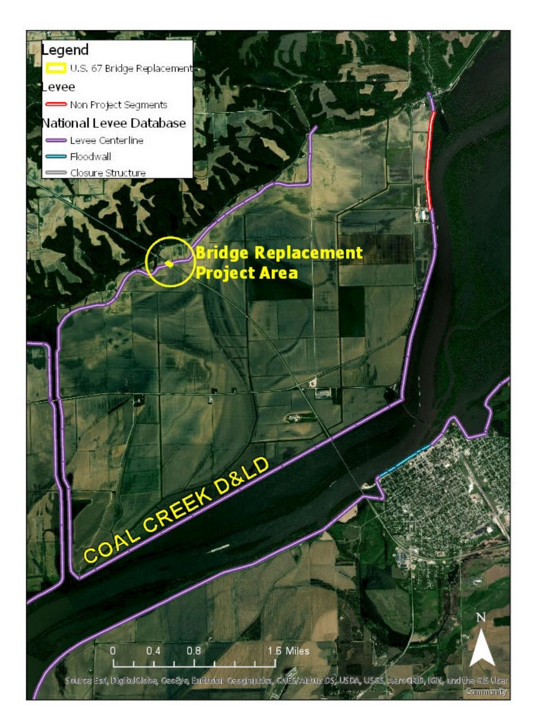
Figure 1. Project area vicinity, showing proposed U.S. 67 Bridge replacement, approximately 3 miles from Beardstown, IL.